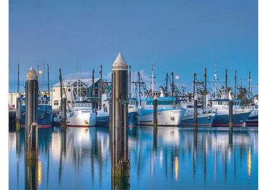
MARITIME COMMERCIAL LITIGATION