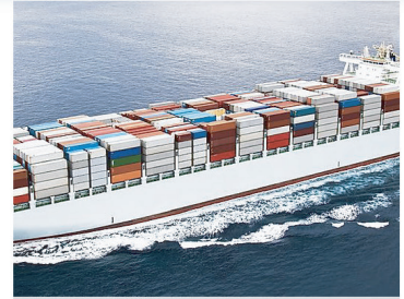
MARINE CARGO/ TRANSPORTATION