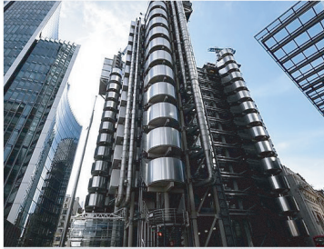
MARINE INSURANCE COVERAGE