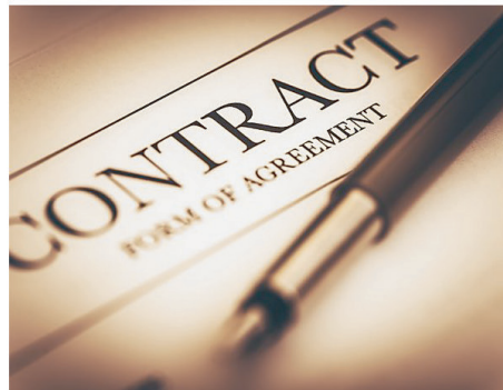
CONTRACT FORMATION & BREACH OF CONTRACT