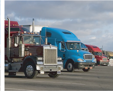
AUTOMOBILE / TRUCKING DEFENSE