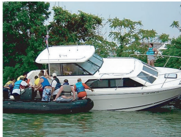
RECREATIONAL BOATING ACCIDENTS