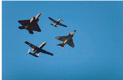
DEFENSE BASE ACT