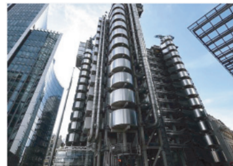
MARINE INSURANCE COVERAGE