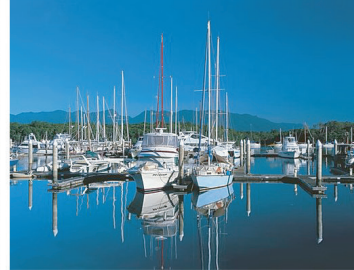
MARITIME COMMERCIAL TRANSACTIONS