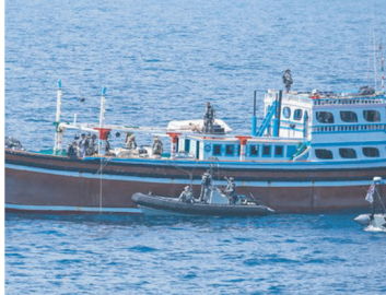
VESSEL SEIZURE/ ARREST OF VESSEL