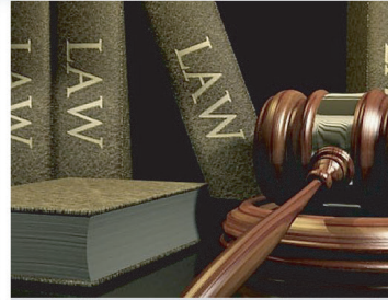
LIMITATION OF LIABILITY ACT